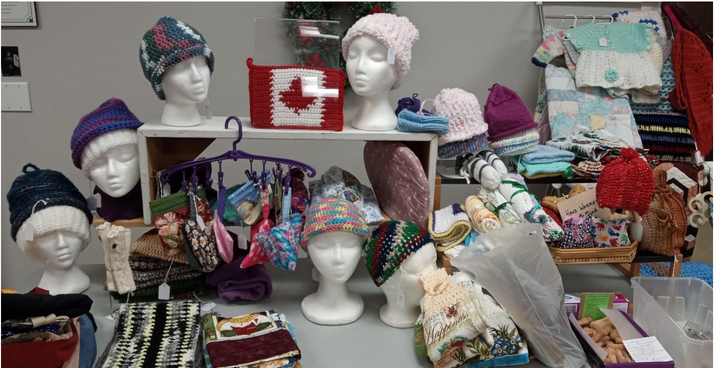
All the hand-made items from Mollie's Nook on display at a very successful craft fair.