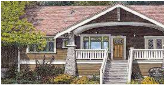
Mollie Nye House 940 Lynn Valley Road North Vancouver, BC

Mollie Nye House is operated by Lynn Valley Services Society. Staff and volunteers are proud to continue the Nye family tradition of serving the community. LVSS offers a wide variety of programs, services and events for all ages, throughout the week and weekends, all year long. Our reception desk is open Monday to Friday from 10 am to 4 pm. Stop by and visit us. Email: info@mollienyehouse.ca Website: www.lvss.ca